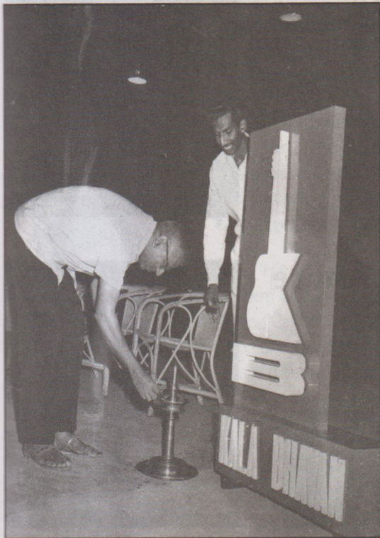
The Kalabhavan is born- Justice V.R. Krishna Iyer inaugurating the Kalabhavan thirty years ago by lighting a traditional oil lamp.