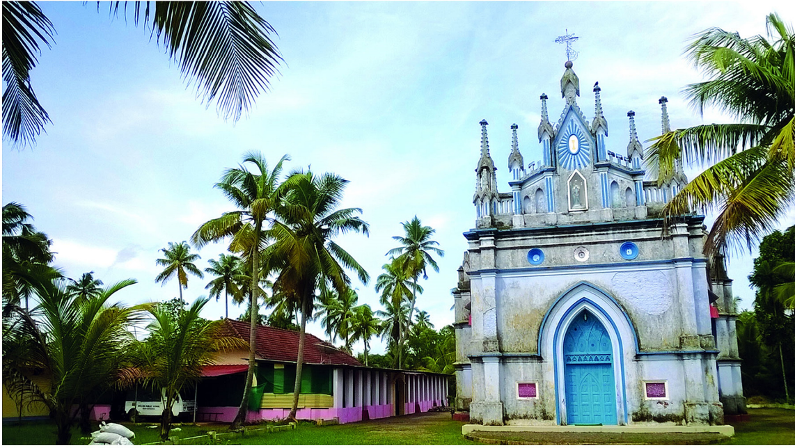
Mary Immaculate Church Orslem, Udayanapuram, Vaikom (Kadavan Church)